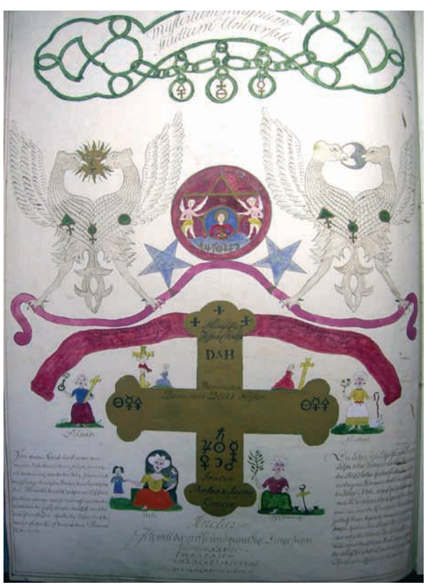
Reproduced image is from a handwritten and handcoloured edition of the Geheime Figuren der Rosenkreuzer, aus dem 16ten und 17ten Jahrhundert from 1785, showing the Mysterium Magnum Studium Universali.

on this side of the abyss, and with the aid of Jesus Christ fight against the devil and darkness while building the Kingdom of Light, so that everything finally will be able to reintegrate back to its original condition. The means to do so was to teach the members in the arts of alchemy, magic and prophecy, through an